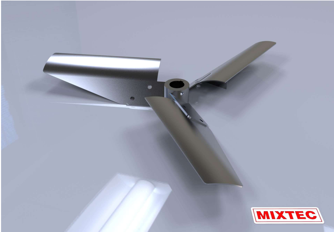
Mixtec HA700 Hydrofoil Impeller – low shear, high pumping rate/unit energy

A hydrofoil impeller creates the low shear axial flow that is necessary to achieve floc formation whilst avoiding damage to the newly formed floc. The impeller diameter is determined by selecting the optimal ratio between the tank dimensions and impeller diameter. This will create effective mixing with sufficient flow whilst dissipating the input power over a large area. The tip speed of the impeller has to be kept below an empirically established maximum speed to ensure shear rates, and hence, damage to the floc does not occur.